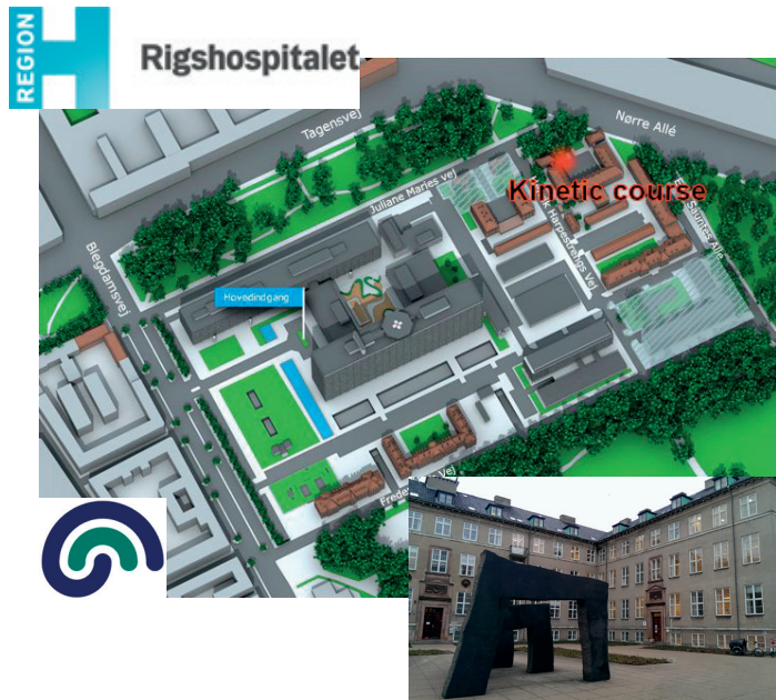
Neurobiology Research Unit, Rigshospitalet

The course will be given at the Neurobiology Research Unit (www.nru.dk), Rigshospitalet, Copenhagen University Hospital, Denmark. Location will be Rockefeller building 6931 (Google maps: Juliane Maries Vej 26, DK-2100 Copenhagen).